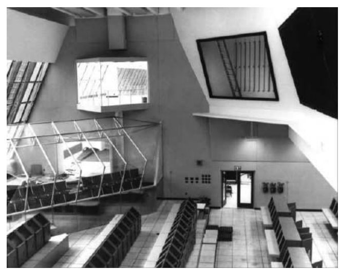
Firing room 1 under construction, August 1965. The VIP viewing area is under the glass wall, at left. The windows on the extreme left looked toward the pads. The triangular extension into the room above the VIP area was for the most distinguished guests.

The O & C building was a multi-storied structure of approximately 56,430 square feet (17,200 square meters), containing as much flexibility as the Apollo spacecraft that it would test. A high bay, 223.8 feet (68.2 meters) long and 100 feet (30.5 meters) high, and an adjacent 251-foot (76.5-meter) long low bay accommodated the three-man Apollo capsule.