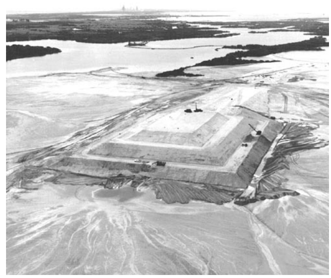
Dredged sand created the 80-foot-high mound that would become launch pad A.

The pumps piled up another portion of the dredged sand on the launch pad, creating a flat-topped pyramid of sand and shell 80 feet (24.4 meters) high. During the process, draglines, bulldozers and other earth-moving equipment molded the mound into the approximate shape of the pad. In a short period of time, the pyramid settled 3.9 feet (1.2 meters), compressing the soil beneath. Bulldozers completed the job by removing part of the pile to achieve the proper elevation.