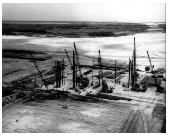
Driving the pilings for the VAB.

At the peak of activity, 10 pile drivers were in action. Three of them were new, electrically driven, vibratory drivers. When the piles reached the first thin stratum of limestone at about 36 meters, steam- or diesel-driven pile drivers took over and pounded the piles into the bedrock, which ranged from 151 feet to 171 feet (46 to 52 meters) below the sandy surface.