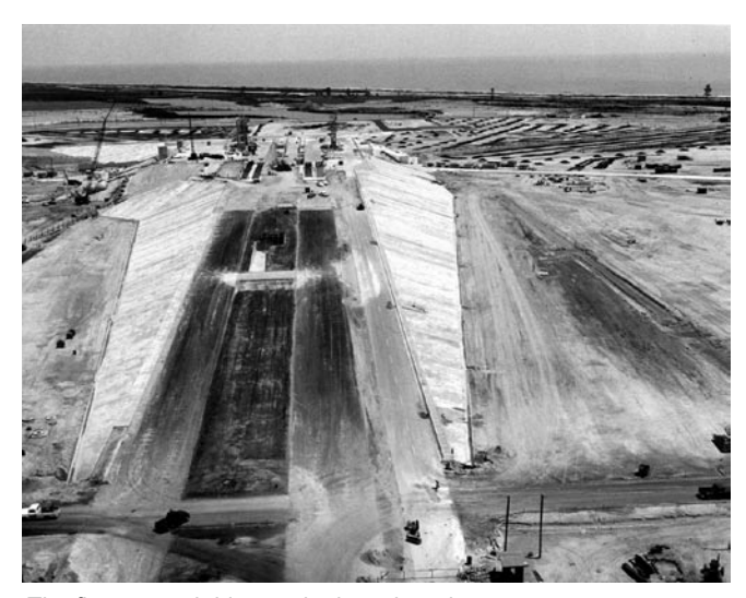
The flame trench bisects the launch pad.

allowed safe egress from the spacecraft, the astronauts could cross over to the mobile launcher on a swing arm. They would then ride one of the high-speed elevators to level A, slide down an escape tube to a thickly padded rubber deceleration ramp, and enter -- through steel doors -- a blast room, which could withstand an on-the-pad explosion of the entire space vehicle.