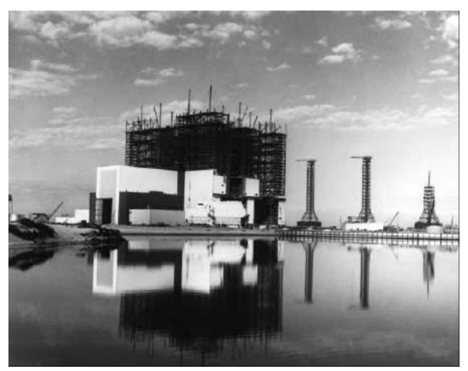
Mobile launchers are visible to the right of the VAB; at left, the launch control center seems to be part of the VAB.