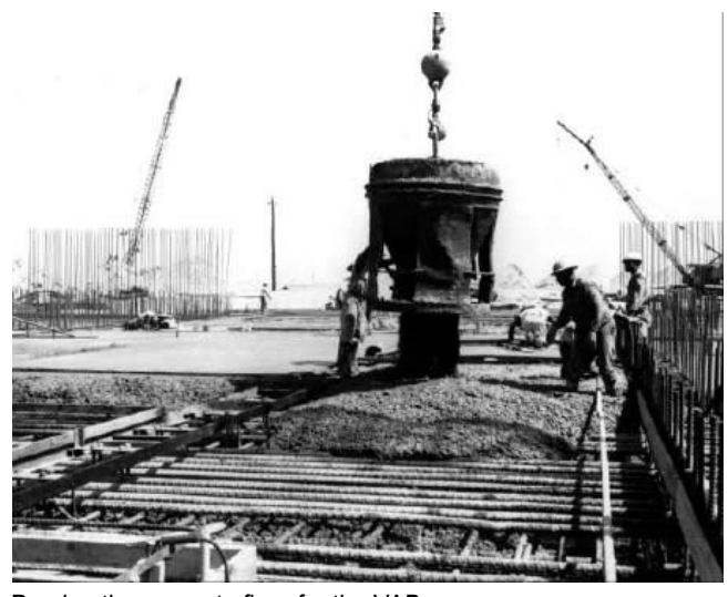
Pouring the concrete floor for the VAB.

Another critical part of the construction was the addition of three cranes. A 175-ton crane with a hook height of about 50 meters would run the length of the building and would traverse both the low bay and high bay areas above the transfer aisle. Two other cranes, with a 250-ton capacity and hook height of approximately 140 meters, would be capable of movement from an assembly bay on the opposite side. Although bridge cranes of this capacity are not unusual in heavy industry, there were unique requirements for precision, smoothness and control of their vertical and horizontal movement. The cranes would cost about $2 million.