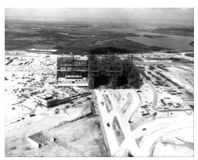
The VAB rises in steel to dominate the landscape. On the left is the lower Launch Control Center. In the foreground are the crawlerway and roads.

With steel column sections and other structural steel arriving at the job site, erection of the framework began in January 1964 in the low bay area. By this time, the original contract date for completing the structural steel