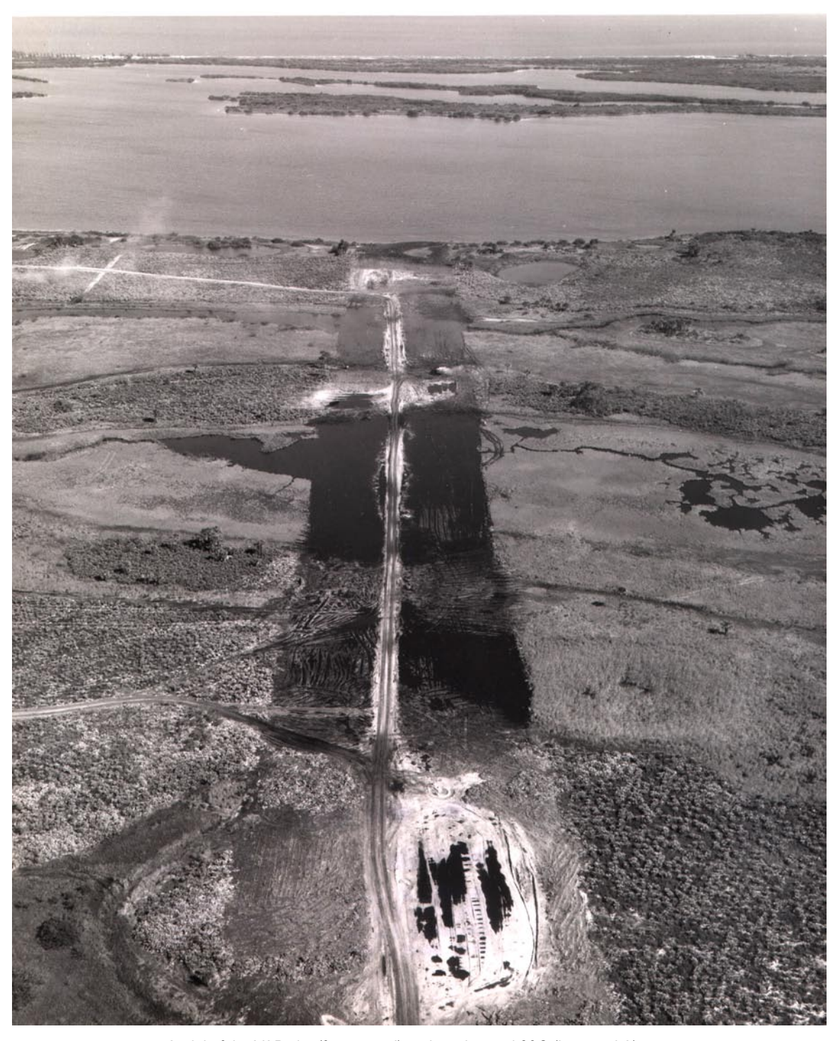
Aerial of the VAB site (foreground) and road to pad 39C (later pad A) during dredging of access channel, Jan. 23, 1963.

National Aeronautics and Space Administration Kennedy Space Center, FL