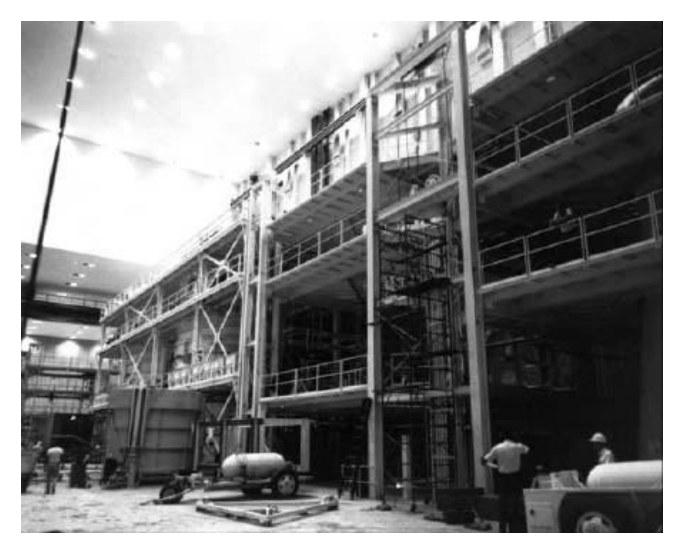
Interior of the Operations and Checkout building, August 1965. The two partly visible silos at left are altitude chambers.

The central instrumentation facility centralized the handling of NASA data and provided housing for general instrumentation activities that served more than one complex. The Launch Operations Center coordinated the planning with the other NASA centers and with the Atlantic Missile Range.